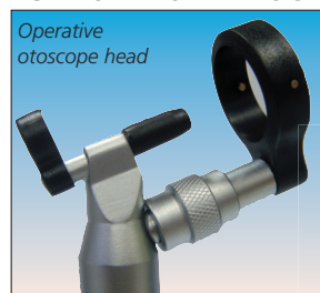
Operative otoscope head