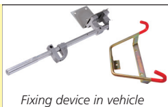
Fixing device in vehicle